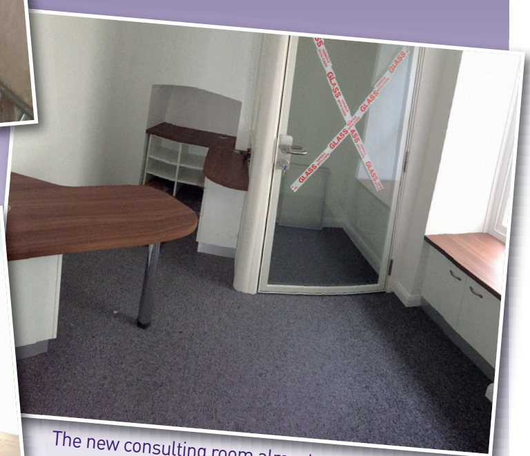
The new consulting room almost ready for use.