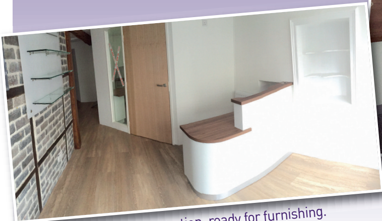
The finished reception, ready for furnishing.