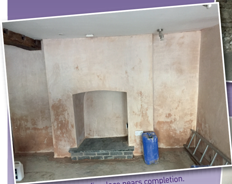
The feature fireplace nears completion.