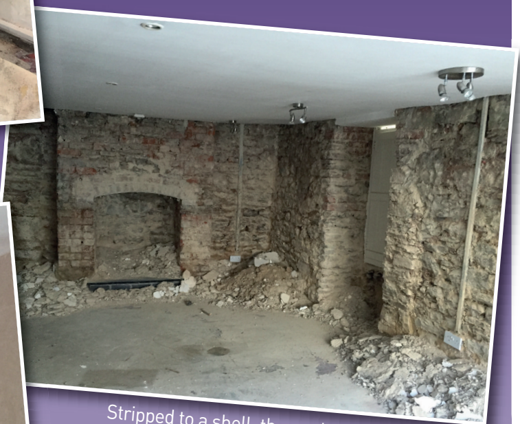
Stripped to a shell, the work begins...

Building work at our brand new store at 109 Monnow St, Monmouth NP25 3EG is well underway. Here are a few pictures of the work that we are undertaking at present. As you can see, we have been very busy and are very much looking forward to our grand opening on the 9th August 2016.