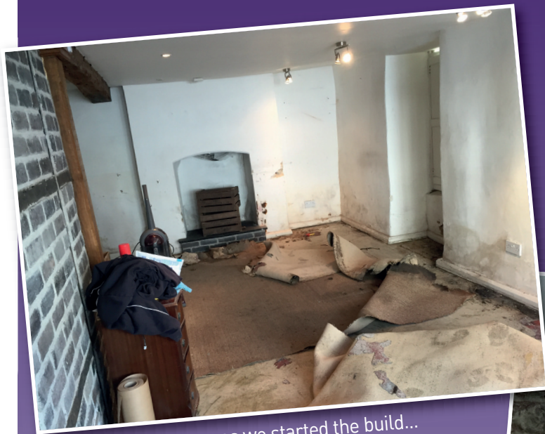
The scene as we started the build...

Building work at our brand new store at 109 Monnow St, Monmouth NP25 3EG is well underway. Here are a few pictures of the work that we are undertaking at present. As you can see, we have been very busy and are very much looking forward to our grand opening on the 9th August 2016.